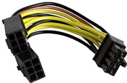
Figure 5. Dual 6-Pin to 8-Pin Adapter Cable

It is possible to combine two 6-pin auxiliary PCIe connectors into a single 8-pin auxiliary PCIe connector. If you are using such an adapter, it is important to ensure that the 12V rail on the power supply driving this adapter is rated for at least 18A.