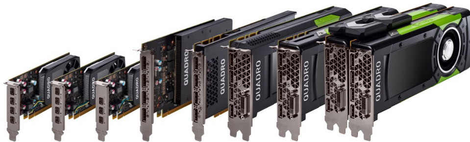
Figure 1. NVIDIA Quadro Graphics Cards

This application note discusses the power requirements of the NVIDIA® Quadro® line and Quadro RTX™ line of graphics cards. A suitable power supply is necessary to maintain system integrity under computational load.