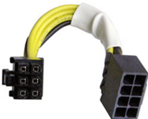
Figure 4. 8-Pin to 6-Pin Adapter Cable

It is possible to split a single 8-pin auxiliary PCIe connector into a single or two 6-pin auxiliary PCIe connectors. If you are using such a splitter, it is important to ensure that the 12V rail on the power supply driving this is capable of handling the additional connector. Refer to the rated amperage on the 12V rail sourcing the splitter to ensure that the connector limits are not exceeded.